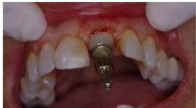
Figure 8: Custom impression coping fixated intraorally supporting the soft tissue.