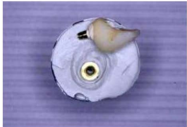
Figure 3: Screw retained provisional removed from the analog within the matrix demonstrating the matrix replicating the emergence profile achieved by the provisional.

Once the stone was completely set, the temporary was unscrewed from the analogue and removed from the stone. The analogue remained at the bottom of a smooth, accurate impression of the contours of the temporary restoration making a mold to create the custom impression coping. (Figure 3)