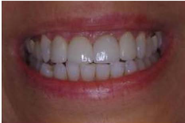
Figure 10: Final restoration showing good soft tissue support and emergence profile replicating what was achieved with the provisional.

On delivery, the restoration fit precisely and harmoniously with the natural and esthetic contours of the gingival. The implant supported restoration is indistinguishable from the adjacent teeth and is a functional and esthetic success. The guess work as to where the tissue will position after restoration placement is eliminated. (Figure 10)