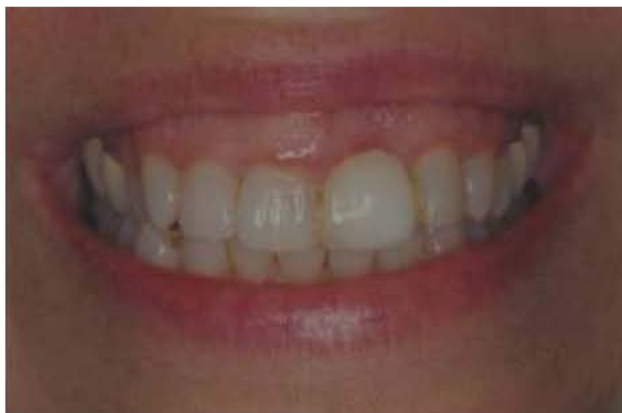
Figure 2: Screw retained provisional following soft tissue healing and development of soft tissue contours and emergence profile.

It has been noted and documented that once the temporary restoration is removed, the gingival tissues tend to collapse and “slump” rather rapidly over the implant platform. Even a relatively fast impression with a standard impression coping will result in an inaccurate model of proper esthetic gingival contour. While some labs may be able to compensate for this by manipulation of the models, it is unpredictable and seldom as esthetically correct as the