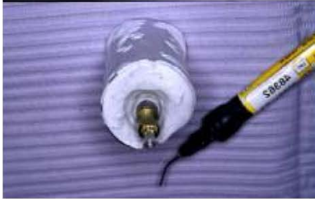
Figure 4: Custom matrix with open tray impression head placed on the analog.