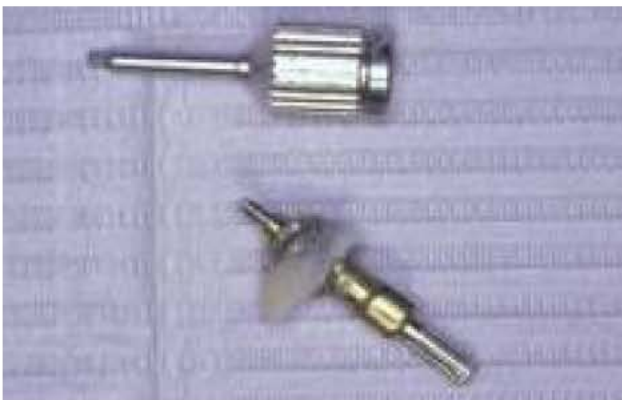
Figure 6: Completed custom impression coping ready for intraoral use.

Once cured, the coping was unscrewed from the implant analogue and removed from the stone mold. The perfect replica of the tissue portion of the temporary was then wiped with alcohol to remove uncured resin in the air inhibited layer. This replica – the custom impression coping – was ready for the final impression. (Figure 6)