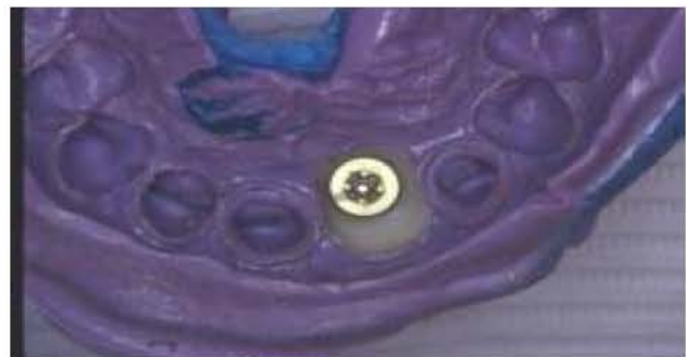
Figure 9: Open tray impression with custom open tray impression head embedded within.