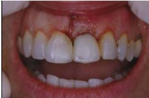
Figure 1: Screw retained implant provisional restoration at site 9, placed at time of implant uncovering.

Over a period of several weeks, the temporary was modified by adding and subtracting composite subgingivally until it reached final esthetic contour and the surrounding tissues were in proper position. When these tissues were pink, firm, stable and healthy, an open impression tray was fabricated (Triad Transheet, Dentsply Prosthetics, York, PA). (Figure 1 and 2)