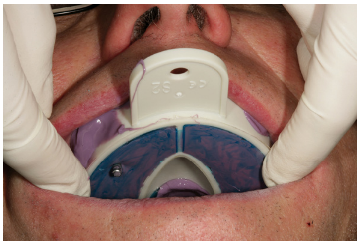
Fig 5. Miratray filled with impression material inserted intraorally and long pin exiting the clear foil of the tray