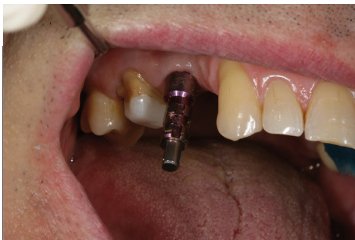
Fig 3. Open tray impression abutment placed upon an implant in the 2nd premolar.

fabrication. (Fig. 6 & 7). A master cast was created from the impression and the prosthetics were completed and returned for insertion. (Fig. 8)