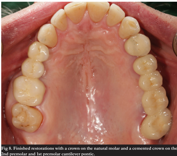
Fig 8. Finished restorations with a crown on the natural molar and a cemented crown on the 2nd premolar and 1st premolar cantilever pontic.