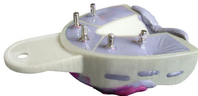
Fig 2. A maxillary full arch impression of 5 implants taken with a Miratray upon removal intraorally.

The technique involves filling the tray with an appropriate impression material, the author recommends either a universal body PVS or a tray or putty PVS. The tray is then inserted over the open tray impression heads intraorally and pressed down crestally until the top of the impression pins are visible through the transparent foil. The practitioner then presses the tray further until the pins puncture the foil and are visible protruding through the foil. This contains the impression material within the tray without the potential problem often seen with use of custom or modified stock trays of the impression material obscuring the tops of the pins. Upon setting, the pins are rotated in a counterclockwise fashion and removed from the impression and the impression is removed intraorally. (Fig. 2) Due to the design of