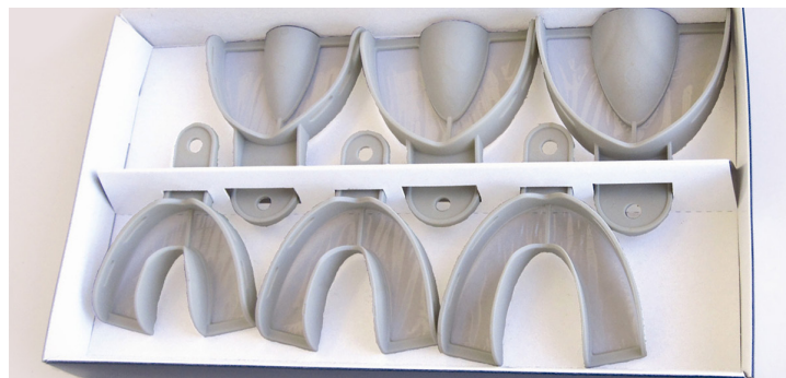
Fig 1. Maxillary and mandibular Miratrays available in small, medium and large sizes.

provide mechanical retention to retain the impression material within the tray. Should the practitioner choose to supplement the retention with a PVS adhesive, it is recommended that it not be applied to the foil surface as this may obscure visualization of the pins when inserting the tray to proper depth. Additionally, it should be noted that PVS adhesive does not adhere to putty PVS materials and do not therefore increase retention of the impression material to the interior of the tray. The PVS adhesive does adhere to all other PVS viscosities.