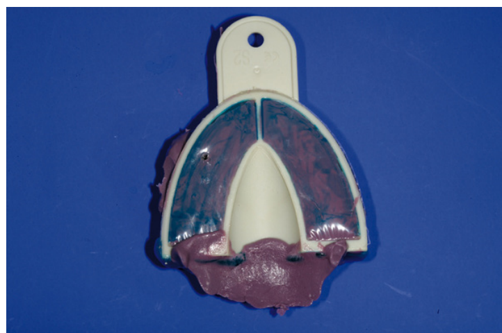
Fig 7. Exterior of the Miratray impression showing the long pin removed from the clear foil after removal intraorally.