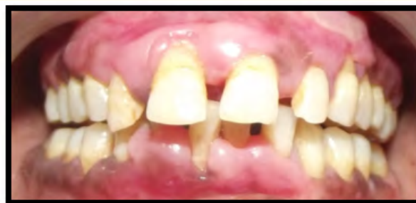
Figure 1: Frontal view.

grade I gingival enlargement, grade II enlargement in relation to 11, 12, 32 and grade III enlargement in relation to 31, 42 (Figure 1). On the palatal surface an oval shaped, firm, diffused, pale pink swelling of size 3X1cm, extending from distal of 13 to distal 23 was seen. It was non-tender, non fluctuant, without any discharge and any other associated symptom (Figure 2). Patient had generalized pockets and pseudo pockets in relation to mandibular anterior teeth. Rest of the oral cavity did not show any abnormality, except 46 which was grossly carious.