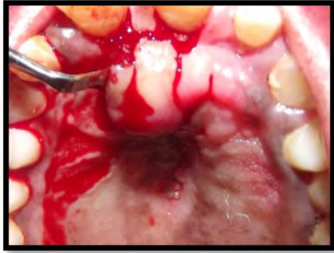
Figure 3: During the surgical procedure.

periodic acid-Schiff and Grocott-Gomori test for bacteria and fungi and tuberculin (Mantoux) test were also performed.