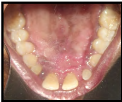
Figure 4: Healing at 15 days.

Routine post operative instructions were given to the patient. She was instructed to abstain from brushing and flossing around the surgical area until healing and to consume only soft food during the first week. Patient was prescribed with Chlorhexidine rinse 0.12% twice daily, morning and at night for a month and Tab. Ibuprofen 400 mg one tablet as per the need to control pain. Post-operatively at 15 days (Figure 4), healing was uneventful with no other side effect reported by the patient.