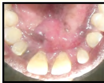
Figure 2: Occlusal view of the palatal swelling.

Patient's signed consent was obtained for the blood examinations, surgical procedure and reporting of the condition for academic purposes. Complete blood count showed low haemoglobin, raised leukocyte count and elevated erythrocyte sedimentation rate (ESR), (Westergren method). An Excisional Biopsy (Figure 3) was performed on the palate and the excised tissue was sent for microscopic evaluation. Other investigations such as chest X-ray,